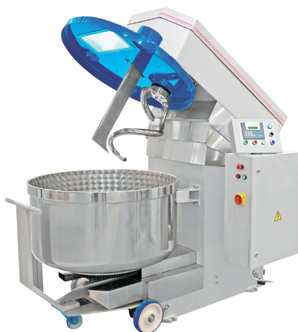
Kneading machine for the food industry