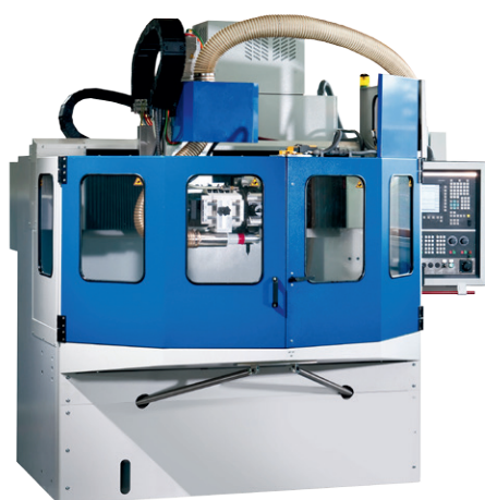
Freudenberg Xpress CNC-machine