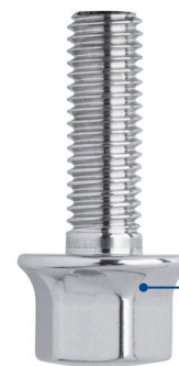
NOVOnox hygienic screw with collar Material: 1.4404 Polished

The information contained herein is believed to be reliable, but no representation, guarantees or warranties of any kind are made to its accuracy or suitability for any purpose. The information presented herein is based on laboratory testing and does not necessarily indicate end product performance. Full scale testing and end product performance are the responsibility of the user.