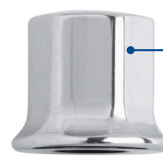
NOVOnox hygienic connection cap nut Material: 1.4404 Polished